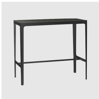
Cut COUNTER/BAR HEIGHT TABLE CANE-LINE