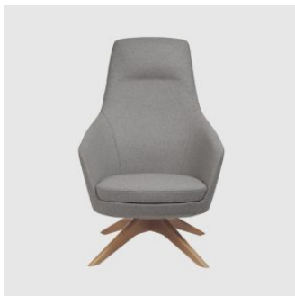
Delphi Plus Timber Swivel