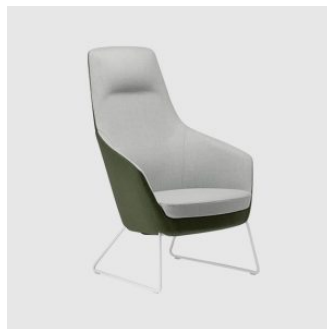
Delphi Plus Sled