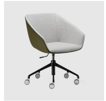
Delphi 5-Way on Castors TASK ARMCHAIR ADVANTA