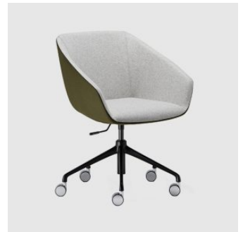
Delphi 5-Way on Castors TASK ARMCHAIR ADVANTA