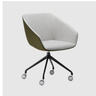
Delphi 4-Way Swivel on Castors MEETING ARMCHAIR ADVANTA