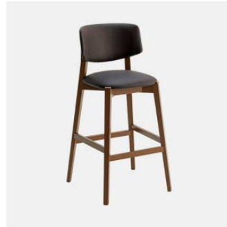
Dixie STOOL CANTARUTTI