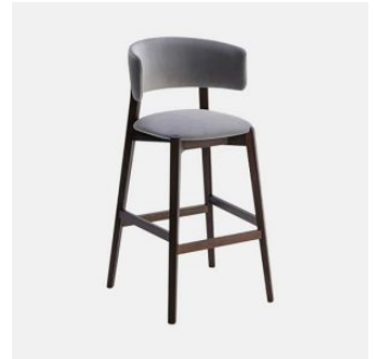
Dixie with Arms STOOL CANTARUTTI