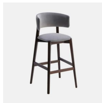
Dixie with Arms STOOL CANTARUTTI