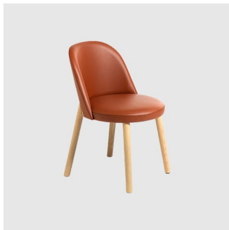
Doc CHAIR ARRMET