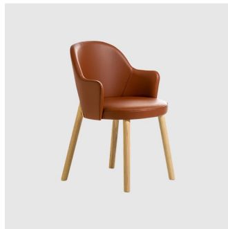
Doc ARMCHAIR ARRMET