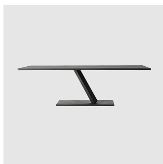
Element Rectangle MEETING/DINING TABLE DESALTO