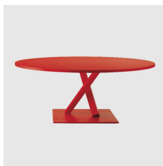
Element Round MEETING/DINING TABLE DESALTO