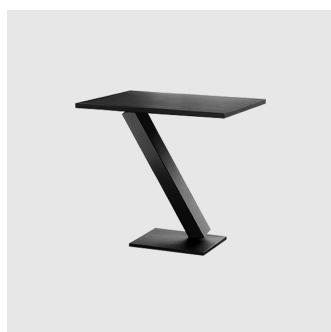
Element SIDE/COFFEE TABLE DESALTO