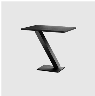
Element SIDE/COFFEE TABLE DESALTO