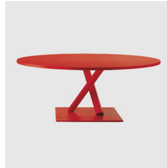
Element Round MEETING/DINING TABLE DESALTO