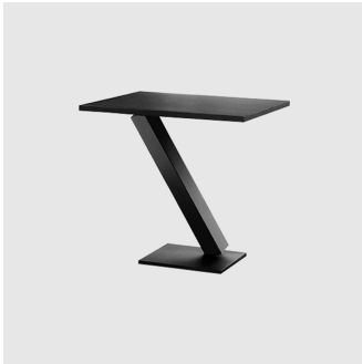
Element SIDE/COFFEE TABLE DESALTO