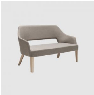
Emily LOUNGE ORIGINS 1971