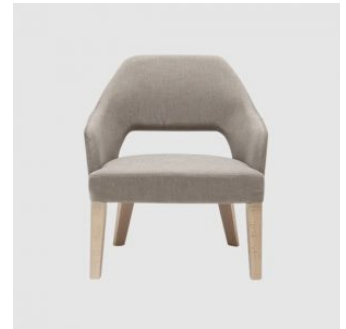
Emily LOUNGE CHAIR ORIGINS 1971