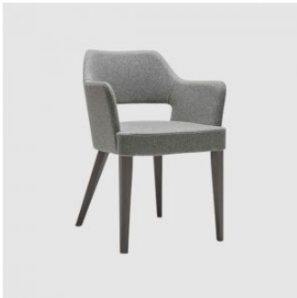
Emily ARMCHAIR ORIGINS 1971