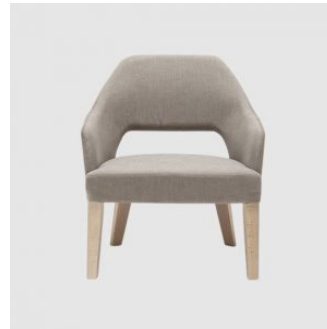
Emily LOUNGE CHAIR ORIGINS 1971