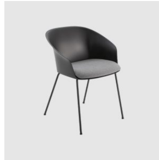
Finna Metal 4-Leg ARMCHAIR CRASSEVIG