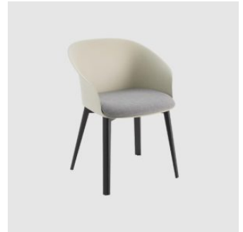
Finna Timber 4-Leg ARMCHAIR CRASSEVIG