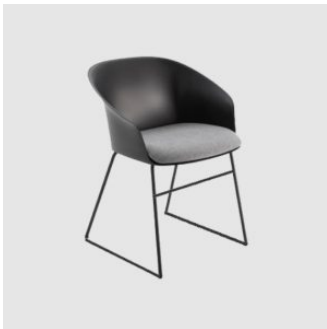
Finna Sled ARMCHAIR CRASSEVIG