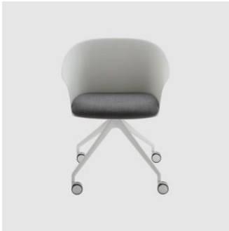
Finna 4-Way Swivel ARMCHAIR CRASSEVIG