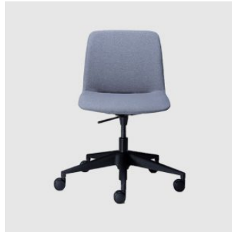
Foster 5-Way on Castors