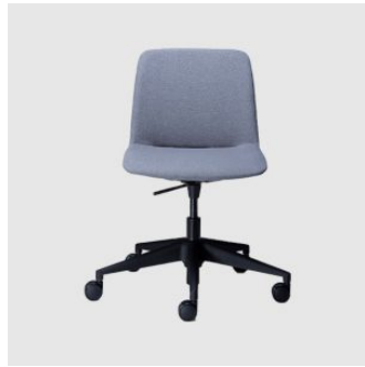
Foster 5-Way on Castors TASK CHAIR OFFICE EDIT