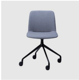
Foster 4-Way Swivel on Castors MEETING CHAIR OFFICE EDIT