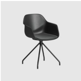
FourMe® 11 4-Way Swivel MEETING ARMCHAIR OCEE & FOUR DESIGN