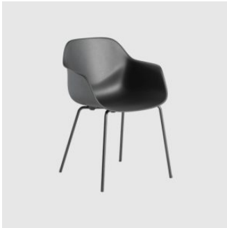
FourMe® 44 Metal 4-Leg ARMCHAIR OCEE & FOUR DESIGN