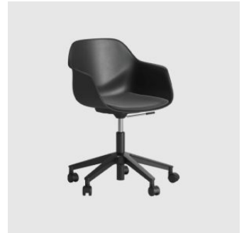
FourMe® 66 5-Way Castor TASK ARMCHAIR OCEE & FOUR DESIGN