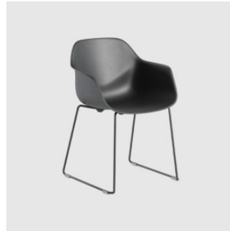
FourMe® 88 Sled ARMCHAIR OCEE & FOUR DESIGN