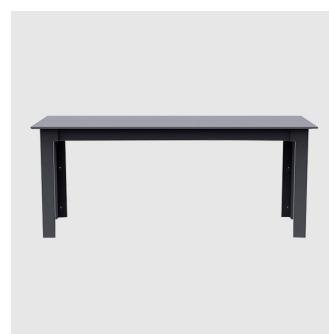
Fresh Air CAFÉ/DINING TABLE LOLL DESIGNS