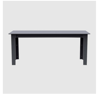
Fresh Air CAFÉ/DINING TABLE LOLL DESIGNS