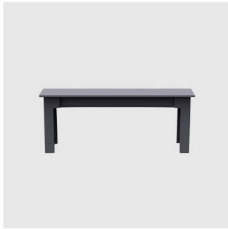
Fresh Air BENCH LOLL DESIGNS