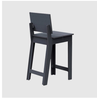
Fresh Air STOOL LOLL DESIGNS