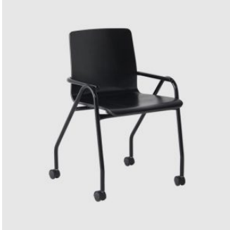
Full Hurdle 4-Leg Castor