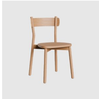
Charlie STACKING CHAIR ALOR