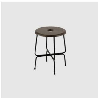
Greene Low STOOL DOWEL JONES