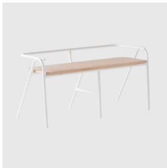
Half Hurdle BENCH DOWEL JONES