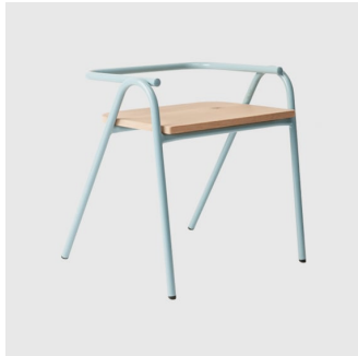
Half Hurdle CHAIR DOWEL JONES