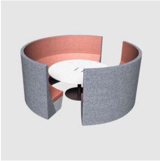
Huddle Collaborative Booth