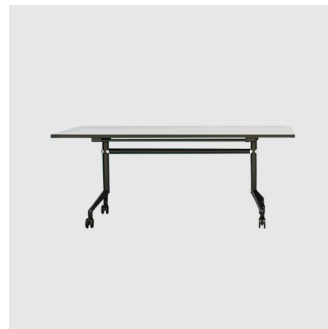
I.AM FOLDING TABLE THINKING WORKS