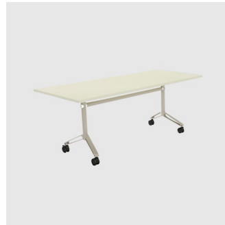
Incognito FOLDING TABLE THINKING WORKS