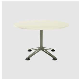
Incognito Round/Square TABLES THINKING WORKS