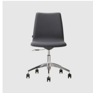
Isabel 01 5-Way Castor