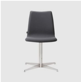
Isabel 01 4-Way Pedestal