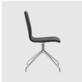
Isabel 01 4-Way Swivel