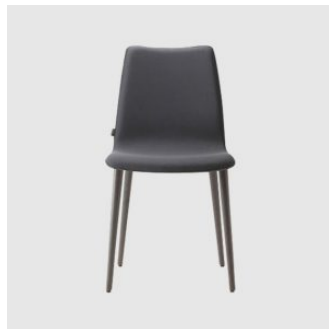
Isabel 01 Timber 4-Leg