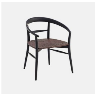
Karma ARMCHAIR CANTARUTTI