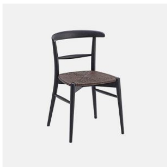
Karma CHAIR CANTARUTTI