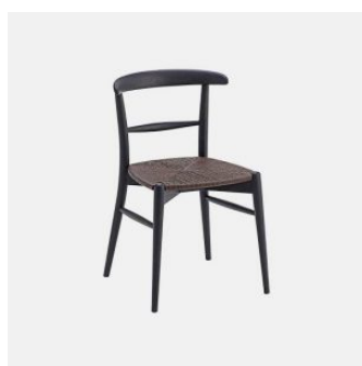
Karma CHAIR CANTARUTTI