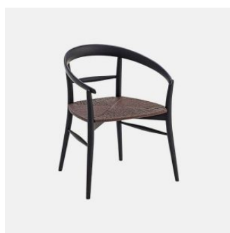
Karma ARMCHAIR CANTARUTTI