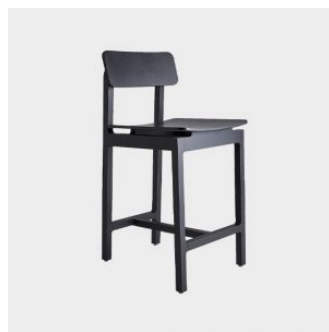
Langdon with Backrest STOOL WORTHY