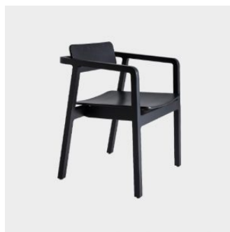
Langdon ARMCHAIR WORTHY