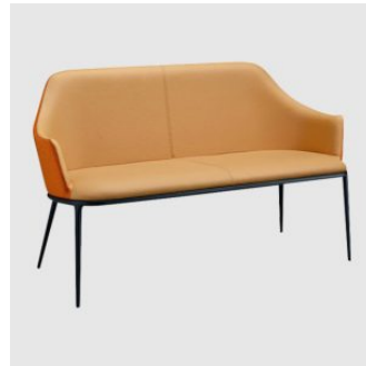
Lea DV LOUNGE MIDJ