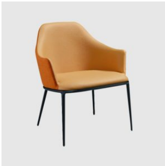
Lea AP LOUNGE CHAIR MIDJ