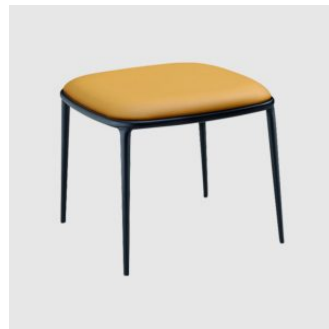
Lea OTTOMAN MIDJ