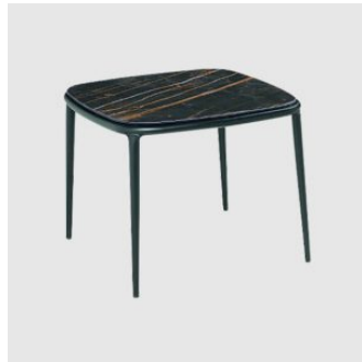
Lea CT SIDE/COFFEE TABLE MIDJ