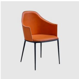
Lea P ARMCHAIR MIDJ