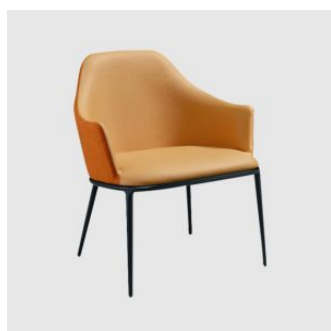
Lea AP LOUNGE CHAIR MIDJ