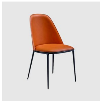
Lea S CHAIR MIDJ