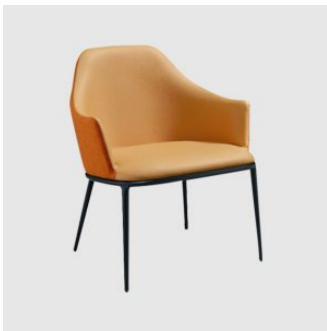
Lea AP LOUNGE CHAIR MIDJ