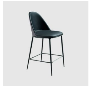
Lea M STOOL MIDJ