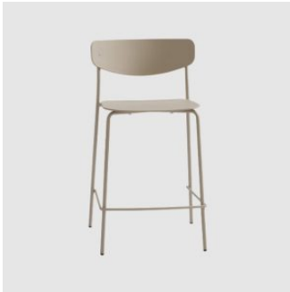
Lea Plastic STOOL INCLASS