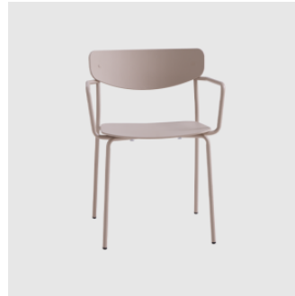
Lea Plastic ARMCHAIR INCLASS