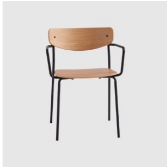
Lea Wood ARMCHAIR INCLASS