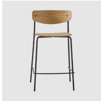
Lea Wood STOOL INCLASS