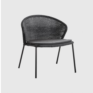
Lean LOUNGE CHAIR CANE-LINE