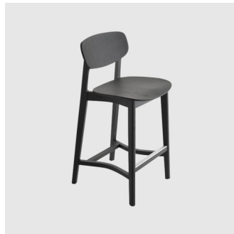
Lene STOOL CRASSEVIG