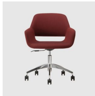
Magda o6 5-Way Castor