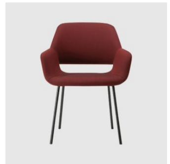
Magda o6 Metal 4-Leg