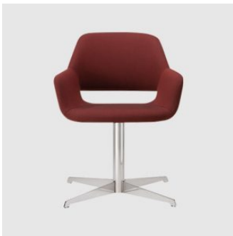
Magda o6 4-Way Pedestal