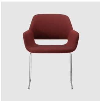
Magda o6 Sled