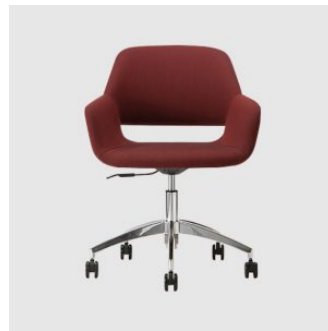
Magda 06 5-Way Castor TASK ARMCHAIR TORRE