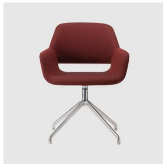
Magda 06 4-Way Swivel MEETING ARMCHAIR TORRE