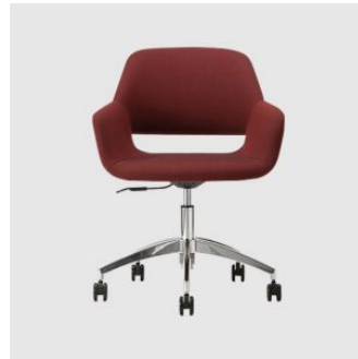
Magda o6 5-Way Castor