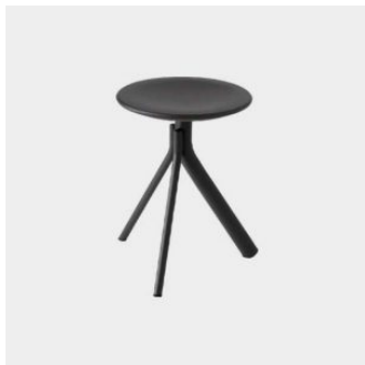
Main Low STOOL ET AL.