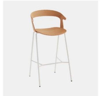
Maki with Arms STOOL CANTARUTTI