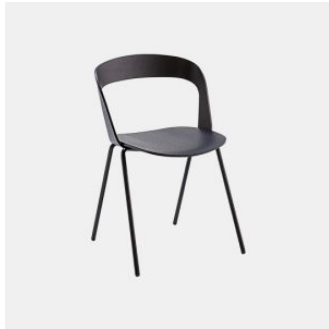
Maki STACKING CHAIR CANTARUTTI