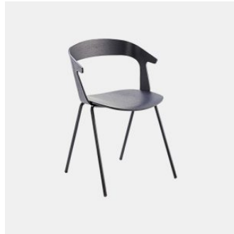
Maki STACKING ARMCHAIR CANTARUTTI