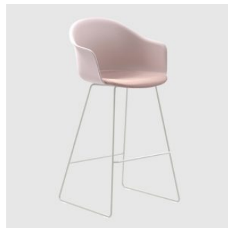
Máni Armshell Sled