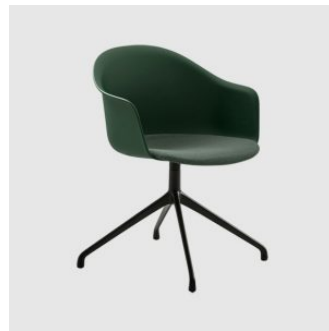
Máni Armshell 4-Way Swivel