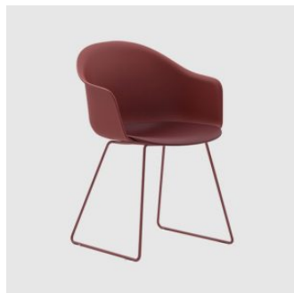
Máni Armshell Sled