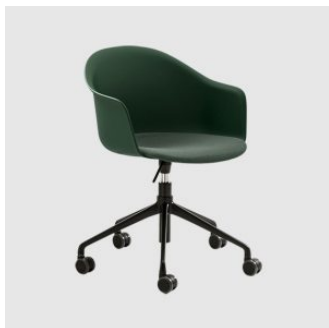
Máni Armshell 5-Way Castor