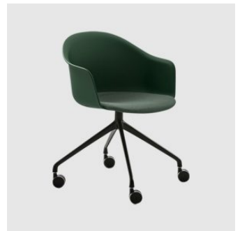
Máni Armshell 4-Way Swivel on Castors