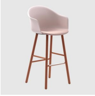
Máni Armshell Timber 4-Leg