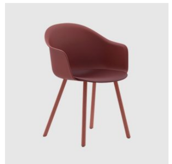
Máni Armshell Timber 4-Leg