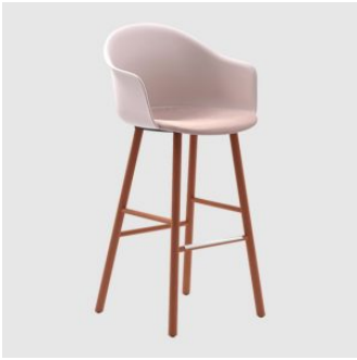
Máni Armshell Timber 4-Leg