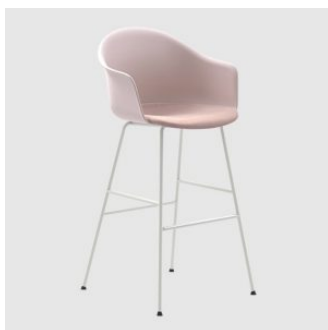
Máni Armshell 4-Leg