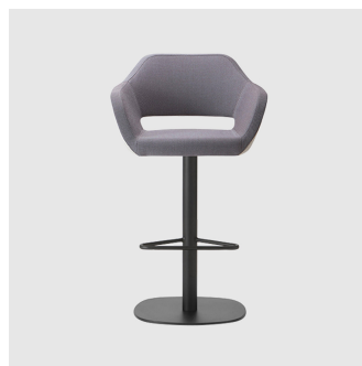
Manu 07 Pedestal STOOL TORRE