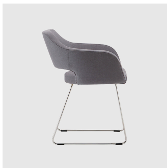
Manu Sled ARMCHAIR TORRE