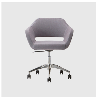
Manu 5-Way Castor TASK ARMCHAIR TORRE