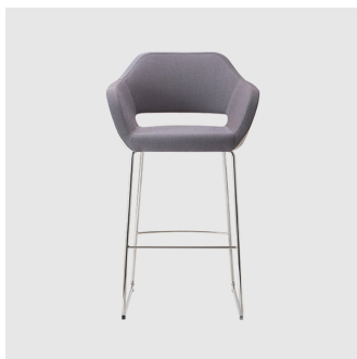
Manu 07 Sled STOOL TORRE