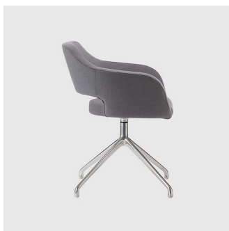
Manu 4-Way Swivel MEETING ARMCHAIR TORRE