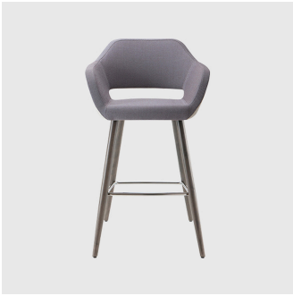
Manu 07 Timber 4-Leg