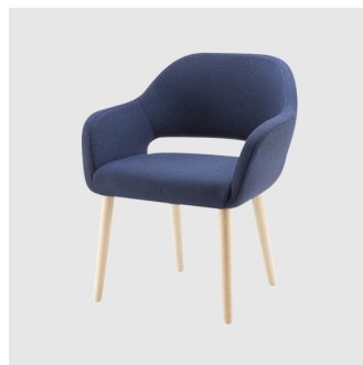
Manu 05 Timber 4-Leg LOUNGE CHAIR TORRE