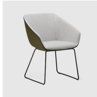
Marlo Sled ARMCHAIR OFFICE EDIT