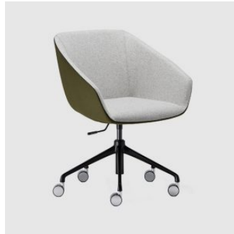
Marlo 5-Way Castor TASK ARMCHAIR OFFICE EDIT