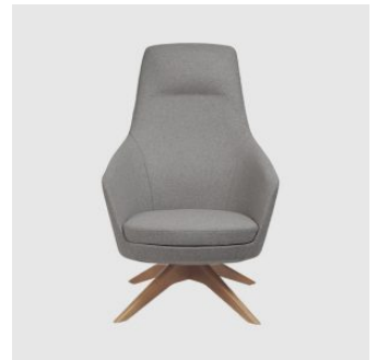
Marlo Plus Timber Trestle LOUNGE CHAIR OFFICE EDIT