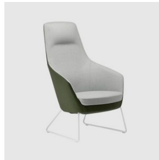
Marlo Plus Sled LOUNGE CHAIR OFFICE EDIT