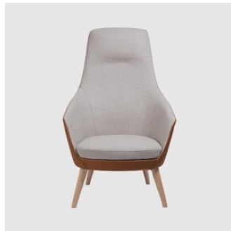
Marlo Plus Timber 4-Leg LOUNGE CHAIR OFFICE EDIT