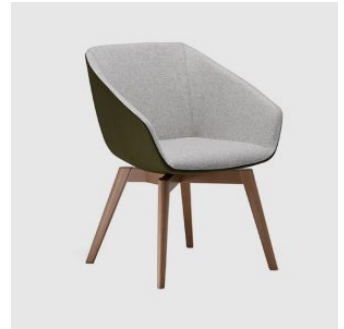
Marlo Timber 4-Leg ARMCHAIR OFFICE EDIT