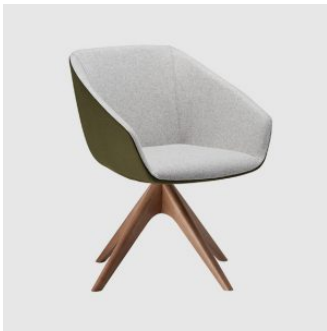
Marlo Timber Trestle ARMCHAIR OFFICE EDIT