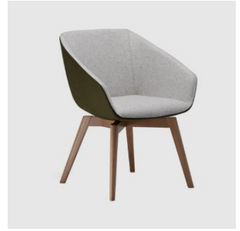
Marlo Timber 4-Leg ARMCHAIR OFFICE EDIT