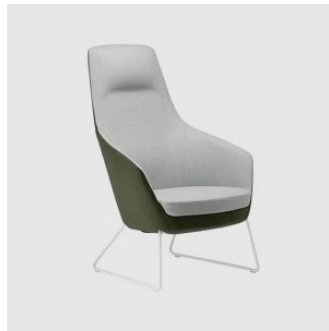
Marlo Plus Sled LOUNGE CHAIR OFFICE EDIT