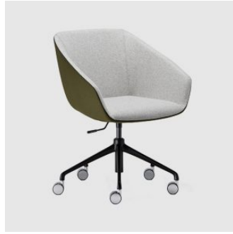
Marlo 5-Way Castor TASK ARMCHAIR OFFICE EDIT