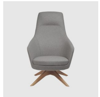
Marlo Plus Timber Trestle LOUNGE CHAIR OFFICE EDIT