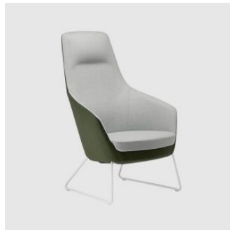
Marlo Plus Sled LOUNGE CHAIR OFFICE EDIT