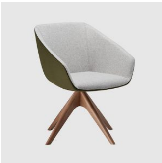
Marlo Timber Trestle ARMCHAIR OFFICE EDIT