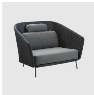
Mega LOUNGE CHAIR CANE-LINE