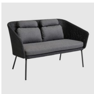
Mega BENCH CANE-LINE