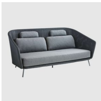
Mega LOUNGE CANE-LINE