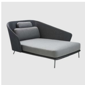
Mega CHAISE LOUNGE CANE-LINE