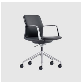
Million Low Back 5-Way Castor MEETING ARMCHAIR ADVANTA