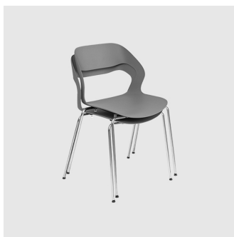
Mixis Air 4-Leg