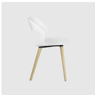
Mixis Air Timber 4-Leg