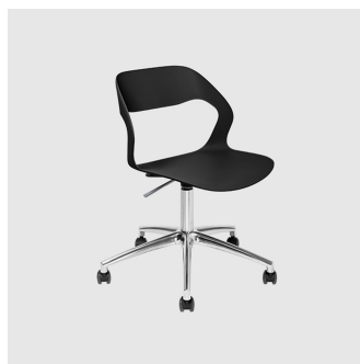
Mixis Air 5-Way Castor