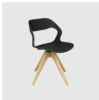
Mixis Air Timber Trestle